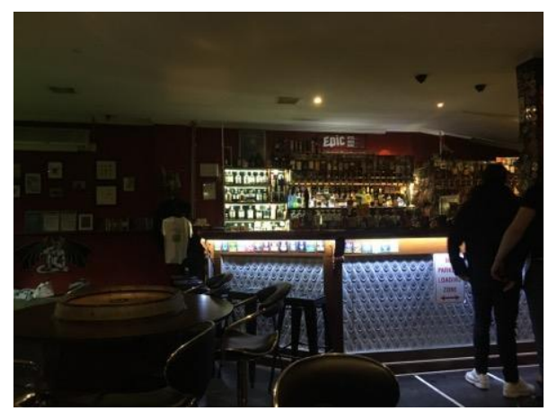
Figure 4. The Bar.

During the day, the space is used much differently in comparison to the late afternoon/evening. It is this transition time when the bar starts to fill with patrons and