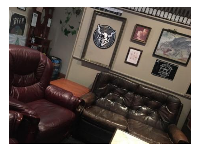
Figure 3. The vintage couch area.

The bar is the central shared space in the venue, people from different