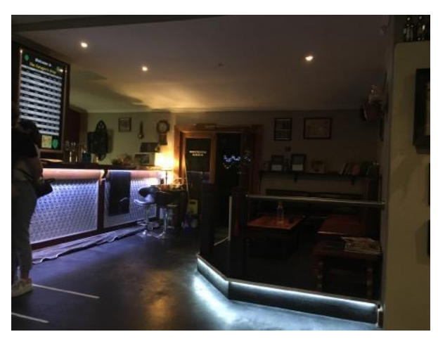
Figure 5. The doors to outdoor area.

when the concept of 'localness' becomes apparent. The majority of daytime patrons use the bar as a quiet space where they can sit in thought over a beer, spend time on their phone or even set their laptop up on a table and work. Background music and chatter of other patrons creates a warm accepting atmosphere where one can engage in conversation or choose to not participate. During the day, personal space has an imaginary barrier that other patrons do not tend to obstruct, unless the person comes up to the bar where free talk and questions etc are accepted. 'Localness' exists during the day but it is subtle, once the transition begins and the bar space starts filling with people, the imaginary boundaries are challenged, and it is around this time the emergence of