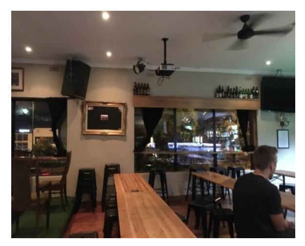
Figure 6. The communal benches and windows looking over street.

imaginary barriers are transformed from a personal space to a local versus visitor space. The locals congregate around the pool table and commandeer the space between the pool table and bar giving them access to the bar tenders and a quicker service. Locals who smoke gather outside commandeering the table closest to the door and almost filtering those who want access to the outside area. Although it seems drunkenness and alcohol allow locals and local spaces to become approachable after a certain time, this is also the area where conflict occurs. Visitors to the bar are squeezed to the space in between the two groups of locals. This performs two functions. Firstly, it makes outcast visitors uncomfortable and persuades them to eventually leave. Secondly, the bar does not employ any security, however the 'localness' mentality bands patrons together helping staff remove anyone who is deemed socially unfit for the bar.