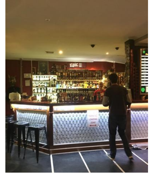
Figure 2. The Bar at Forager's Drop.

groups mix and communicate here. After ordering their drink they head towards one of five spaces to settle in: