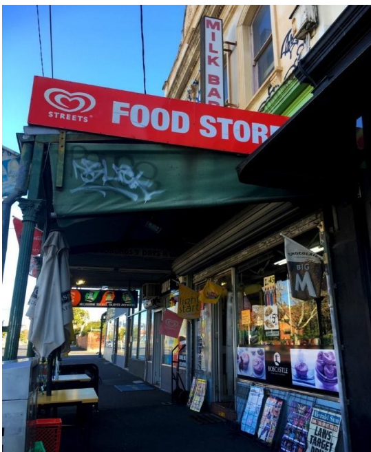
Figure 2: The Milk Bar on Lygon Street. Around this area (residential), there were few bike lanes. The bike lane near the Milk Bar merges directly into the pedestrian path so I have to ride through here.

In order to have a deeper understanding of both perspectives, I decided to observe both cyclists and pedestrians' experiences by actually doing their actions (cycling and walking). As I did so I started to realise the dynamic relations of people on the street. From the perspective of the cyclists, I have observed many cyclists who did not obey the law; by "transforming" themselves from being a cyclist to a pedestrian they turn the corner quicker. The "messy" behaviour of cyclists: (sometimes they ride on both pedestrian and car lane), points out their flexibility to be a pedestrian when they get off the bike.