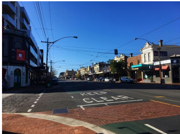
Figure 3: An ordered landscape around Italian restaurants, Lygon Street. Everyone has to "be" in certain lanes.

done, they drink a cream soda on the bench in front the Milk Bar in the unofficial bike path. This could be counted as one of the behaviours that affects cyclists' use of the place. Cycling (and driving) laws are designed to protect pedestrians as they are the most vulnerable ones on the street. The pedestrians are legally able to move very flexibly too, but not because they are physically able to transform into cyclists or cars. Despite the possible dangers of the flexible Uber-rider's transformation into a "pedestrian", they still enjoy flexibility in their movement on Lygon street. However, as they make choices about their movement they do so with the knowledge that they are the most vulnerable on the street, and that if they break a law they are the ones who will probably get hurt; cyclists make choices with the knowledge that their law-bending may hurt others. Pedestrians' slower, relaxed flow of time experience is facilitated by the protection of the law. Ultimately the law is designed to protect the most vulnerable being on the street, therefore others (cars and cyclists) have to take care of the pedestrians when they move on the street. Thus, the pedestrians are in some sense moving without thinking about the law: they are 'outlaws' who are ironically protected by the law. The meaning of the street for the pedestrian is slow, "free" movement from the law because of their outlaw character.