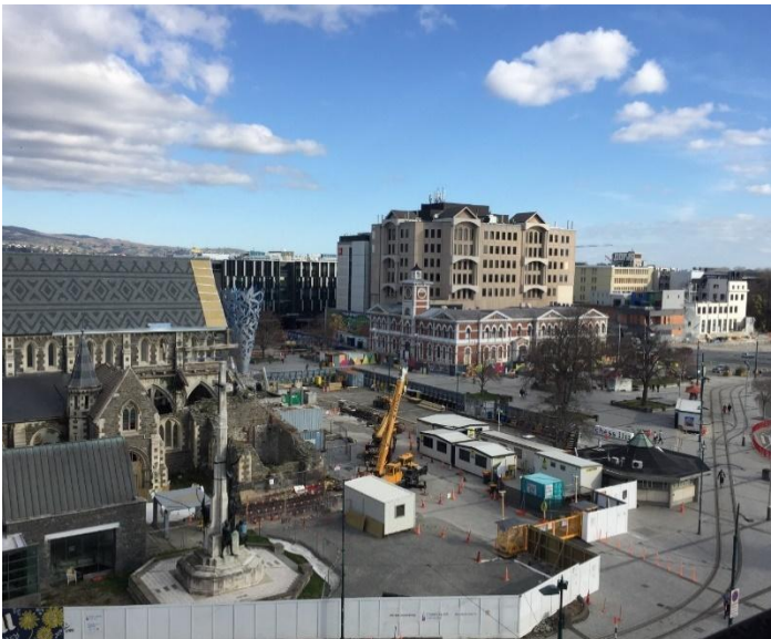
Figure 1. Cathedral Square with the tram tracks on the right-hand side. The permanent food trucks are situated the far corner, in front of the old Post Office building (in red).

The 2010/11 sequence of devastating earthquakes completely transformed the physical appearance of central Christchurch, resulting in the demolition of ninety-five percent of the buildings within the four avenues (Meacham 2017). Yet, as an anthropology student who moved to the city in May 2018, I soon discovered that the natural disaster had caused far more damage than the easily quantifiable loss of bricks and mortar. More importantly, it had disrupted residents' urban taskscapes and exposed the social fault lines of a city with a well-known reputation for insularity. Taking inspiration from McKee (2016) and her examination of the Jewish/Bedouin divide in the Negev, this journal documents the subtle segregation of Christchurch through the eyes of a new arrival, identifying the opposing social separations of 'local' and 'outsider' through the ethnographic observation of Cathedral Square.