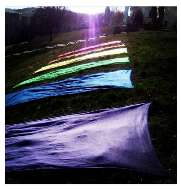
Figure B. Rainbow flags displayed prominently on the Mary Baldwin University campus for National Coming-Out Week.

From the photographs, the student-artists identified common themes and issues and from these, collaboratively developed a short set of four interview questions, listed below.